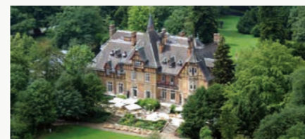
Villa Rothschild Kempinski

Falkenstein Grand Kempinski Debusweg 6-18 61462 Königstein/Falkenstein in Taunus